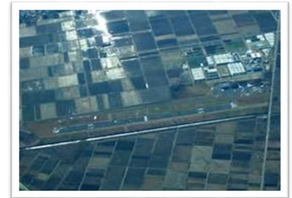
Aerial photo of Hokota city