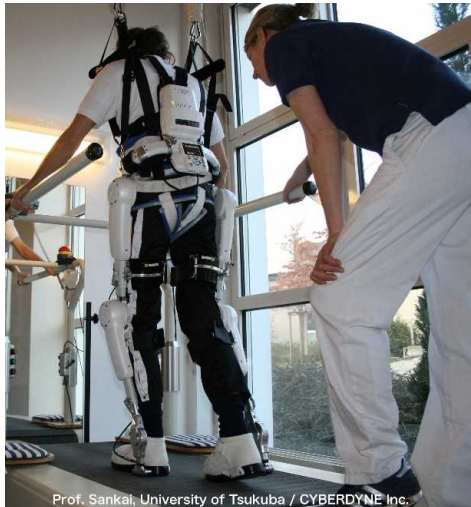
「HAL® for Lower Limb」 CYBERDYNE Inc.