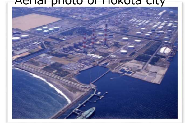
Kashima Seaside Industrial Zone